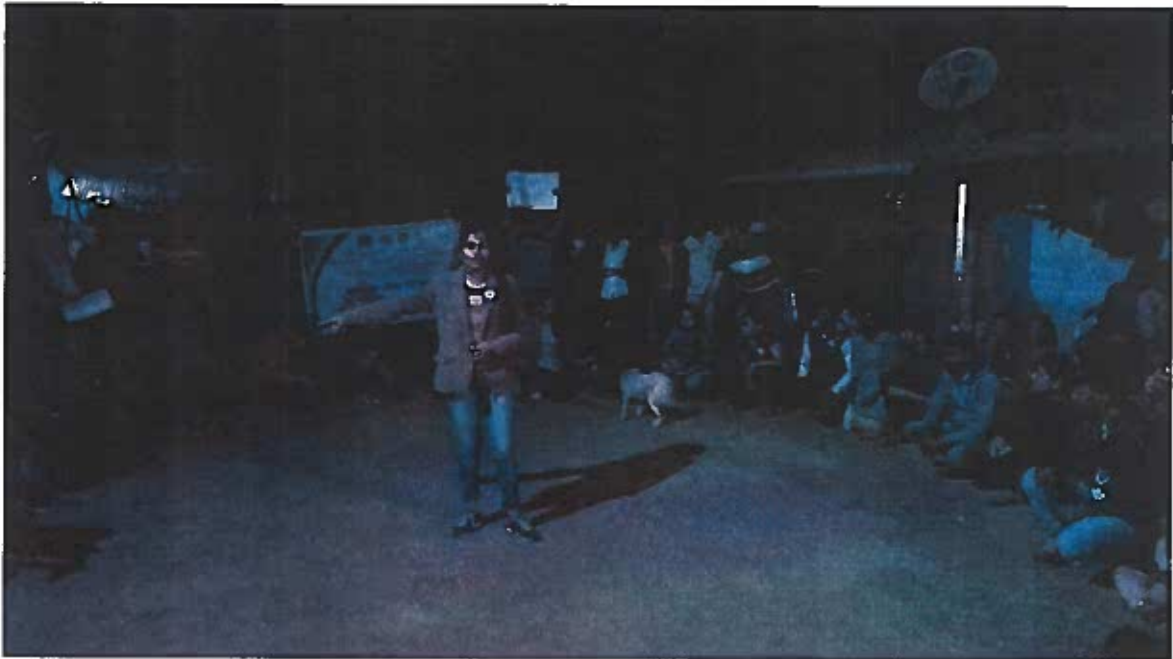
Aids awareness session from team of civil hospital, Trimbakeshwar