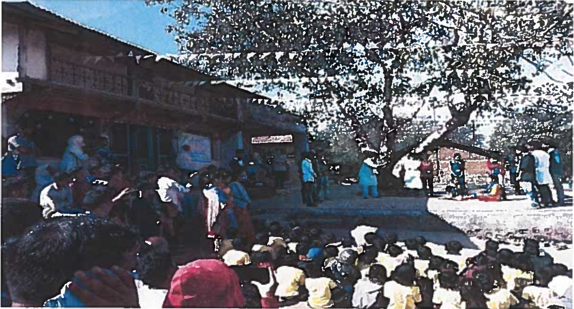
NSS Volunteers along with collected donations for kerala flood relief