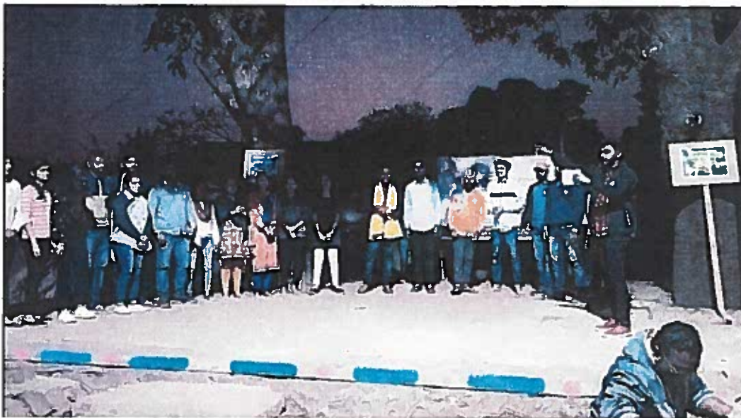
NSS Volunteers concluded rally at central public place at kachurli village