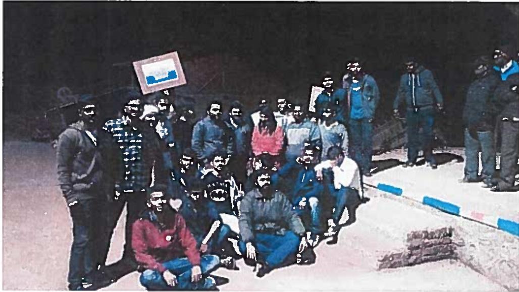
NSS Volunteers participated in the rally