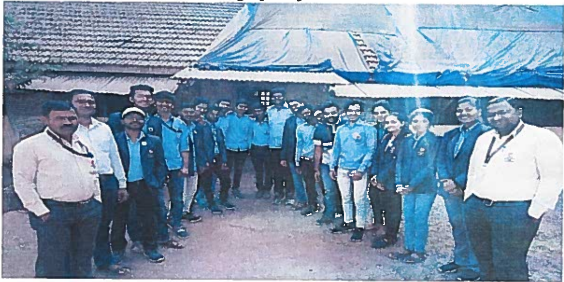
NSS Volunteers gathered at Trimbakeshwar Police Station to depart at Location for crowd management