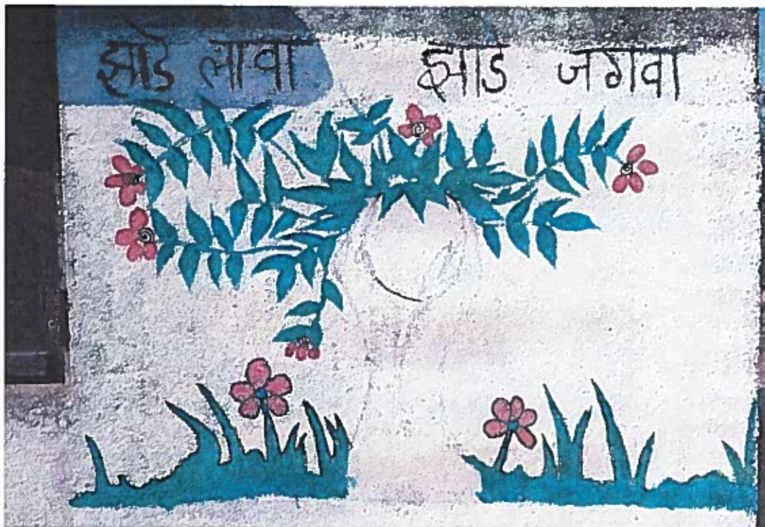
NSS Volunteer made wall painting on save trees