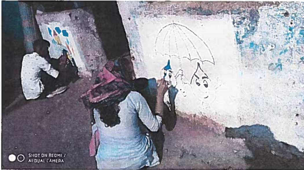
Wall paintings on save water and swachh bharat