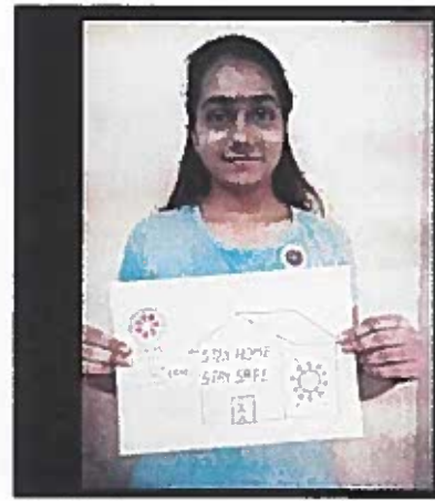
Digital Banners made by students for CoVID-19 Awareness