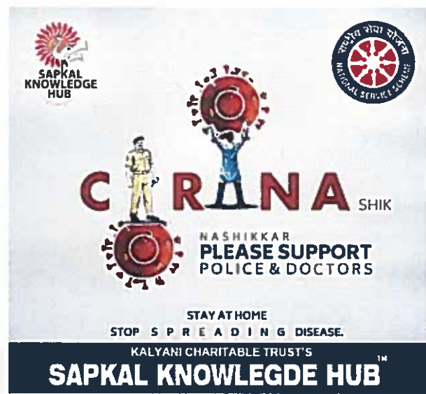
Banners and poster made from college NSS Department