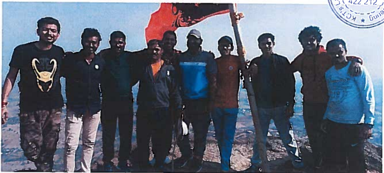
Students enjoyed the trek with nature and history of Durg bhandar fort and Brahmagiri Temple