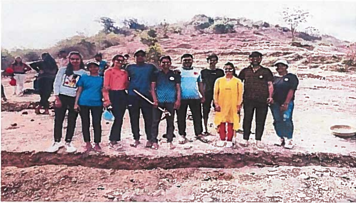
NSS Volunteers teams making CCT