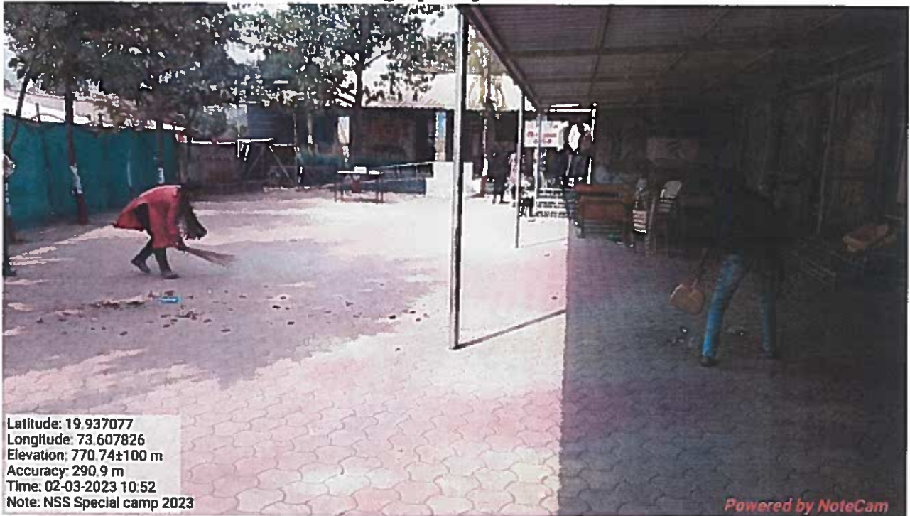
NSS Volunteers cleaning the school of Zilha Parishad at Wadholi