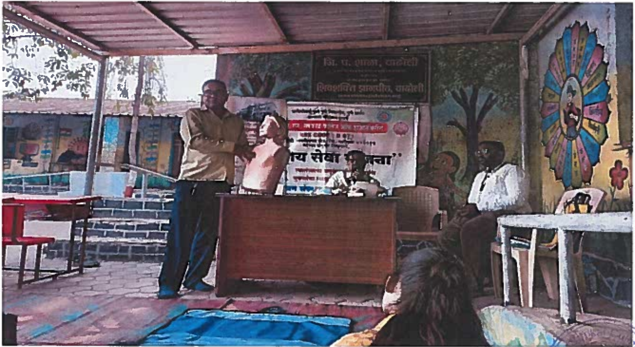
Understanding human body