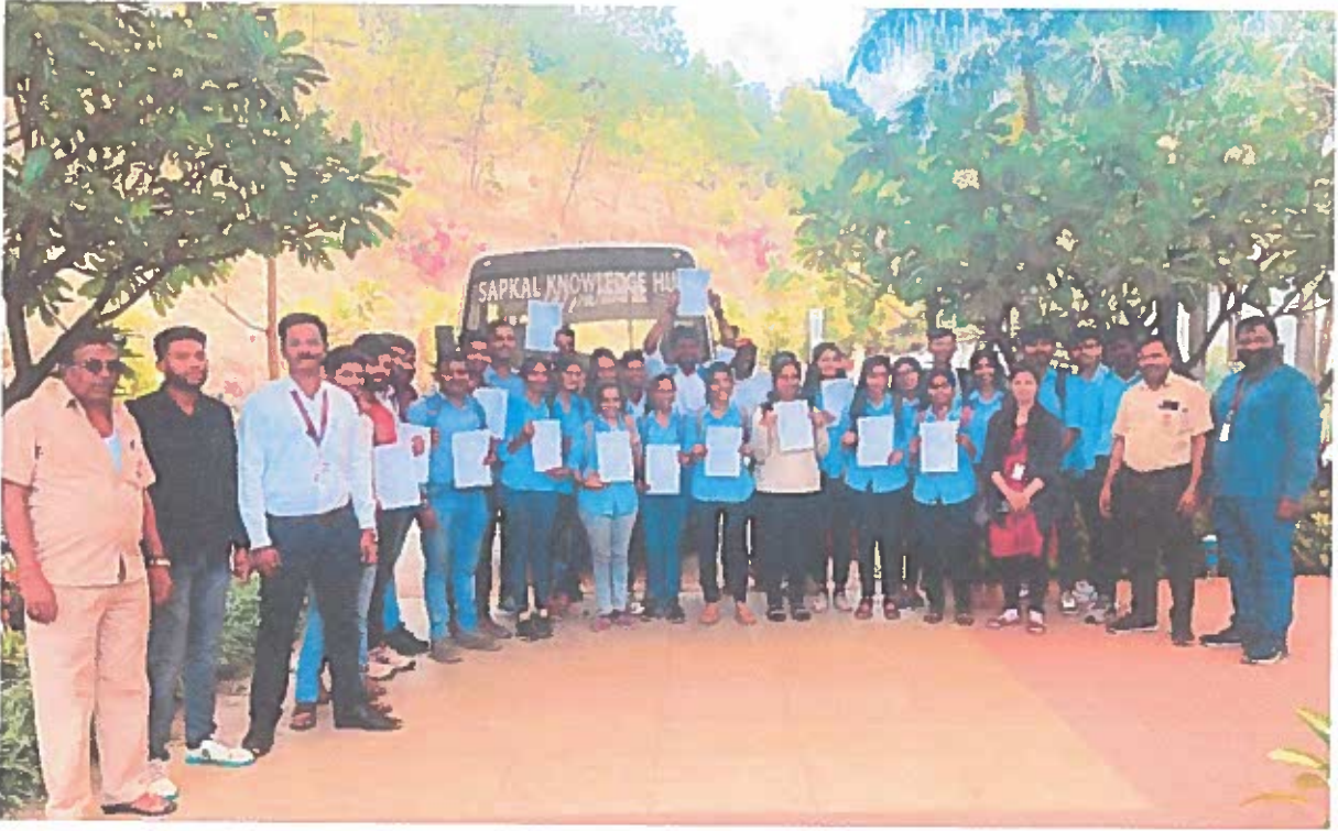
Students with collected data forms