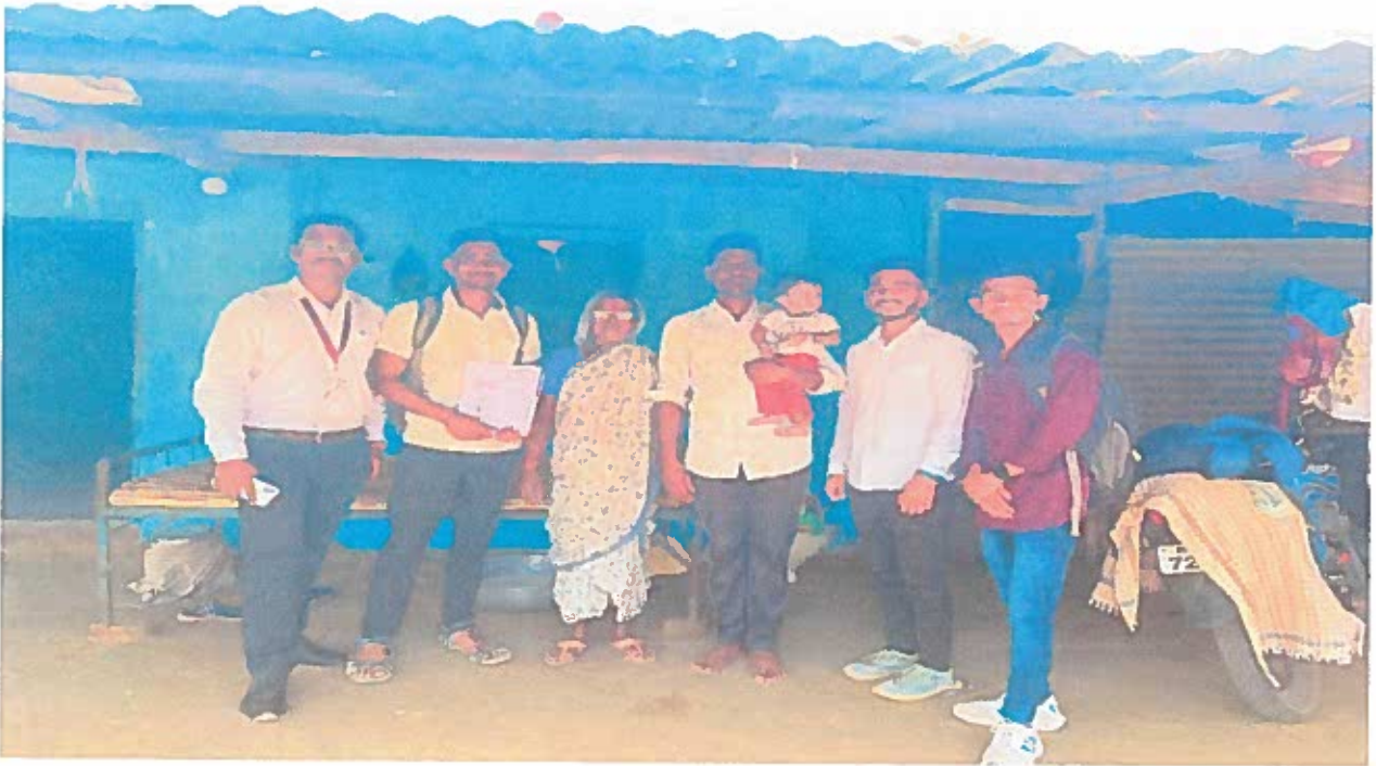
Students visiting each house hold to collect data